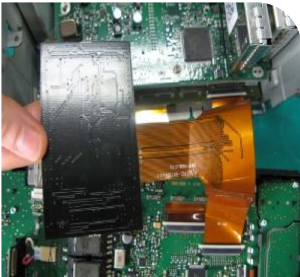
Connect FPC cable to sub-board